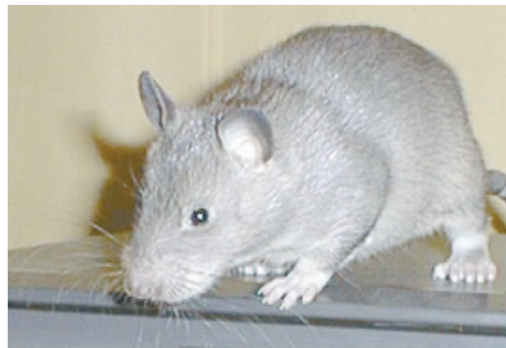
Giant African Pouched Rats are now being trained to detect mines in Tanzania.

A research project in Tanzania trains Giant African Pouched rats to detect landmines. Results have shown that the rats are as capable as dogs at detecting low concentrations of explosives. Rats are quick and easy to train and require less one-on-one handling than dogs. They are small and easy to house, transport, and feed. They have also proven to accommodate repetitive behavior, which typically results in better endurance