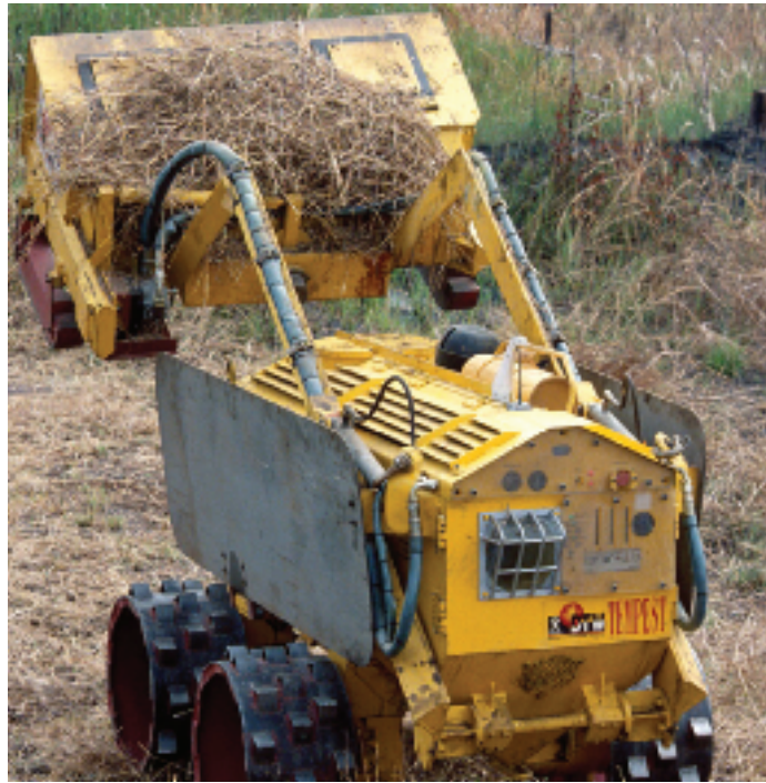
The TEMPEST works by remote control without exposing the operator to danger.

Yes. There are many kinds of machines, such as rotary flails and robots that have been developed and that may be useful in certain circumstances. Flails are devices that are attached to a cylinder and beat the ground as they roll over the land to detonate pressure-sensitive explosives. Machines of this type may not be suitable to all terrain or minefield locations. Robotic machines have also been used to detect and/or destroy landmines. Some robots are designed to roll over the ground and detonate the mines in advance of other techniques. Other robots are more sophisticated and prod the ground in the place of a human. This kind of equipment is expensive to repair or replace.